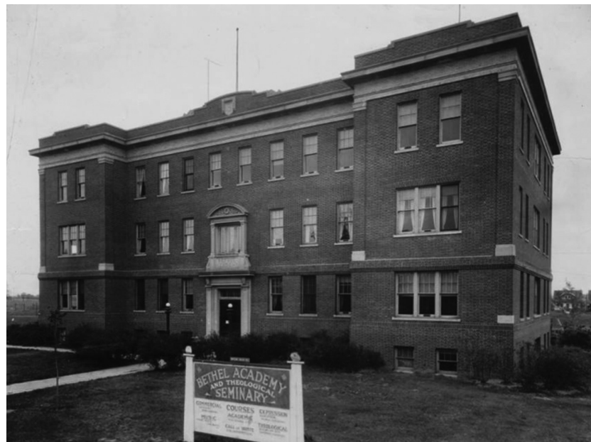
Bethel Academy and Theological Seminary, St. Paul, MN, in 1920.

Throughout the years, Bethel has remembered its rich heritage and held to the guiding principles of its founder while forging a Christ-led vision for the future.